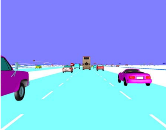
Figure 4. A screenshot of the 3D VISSIM animation

minus ten percent. The results of the five runs were averaged to produce composite results.